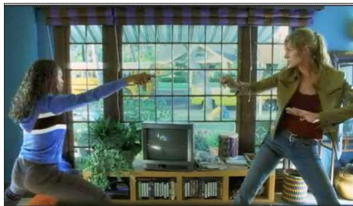
Vernita fights The Bride.

However, as we have just noted, limiting action descriptors to low-level movements has problems. Actions that are specific on a conceptual level may be vague at an atomic level. Fighting, for example, can take many forms, as can physical exercise (riding a bike or jogging, outside or in a gym). In addition, different higher-level actions (such as conversations and arguments) can have the same atomic actions. From the perspective of someone searching for video footage, there is a need to describe higher levels of action representation than the system currently makes possible.